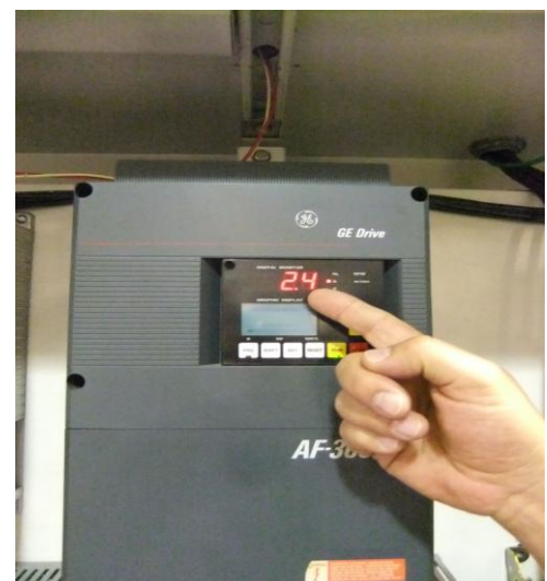
Amperage after lubing with Schaeffer's #450 Food Grade H-1 Hi-Temp Chain Lube

Fourth: Schaeffer's is less expensive than the old chain lube and Schaeffer's #450 out performs it by far!