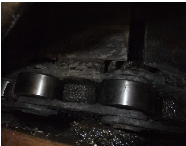
Chain covered in competitor's chain lube gunk

Fifth: Schaeffer's #450 Food Grade Chain Lube cleaned up the gunk left from the previous chain lube. The chain lube actually did the work – not the maintenance crew.